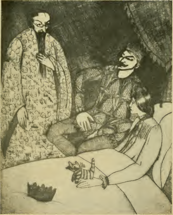
"A SMILE TANGLED SOMEWHERE IN HIS LONG BEARD"